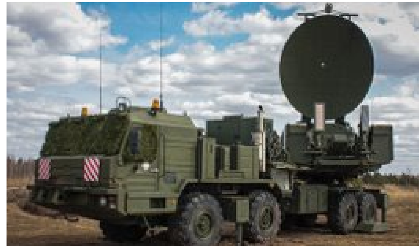
Krasukha jamming system