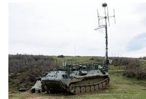
Borisoglebsk-2 jamming system