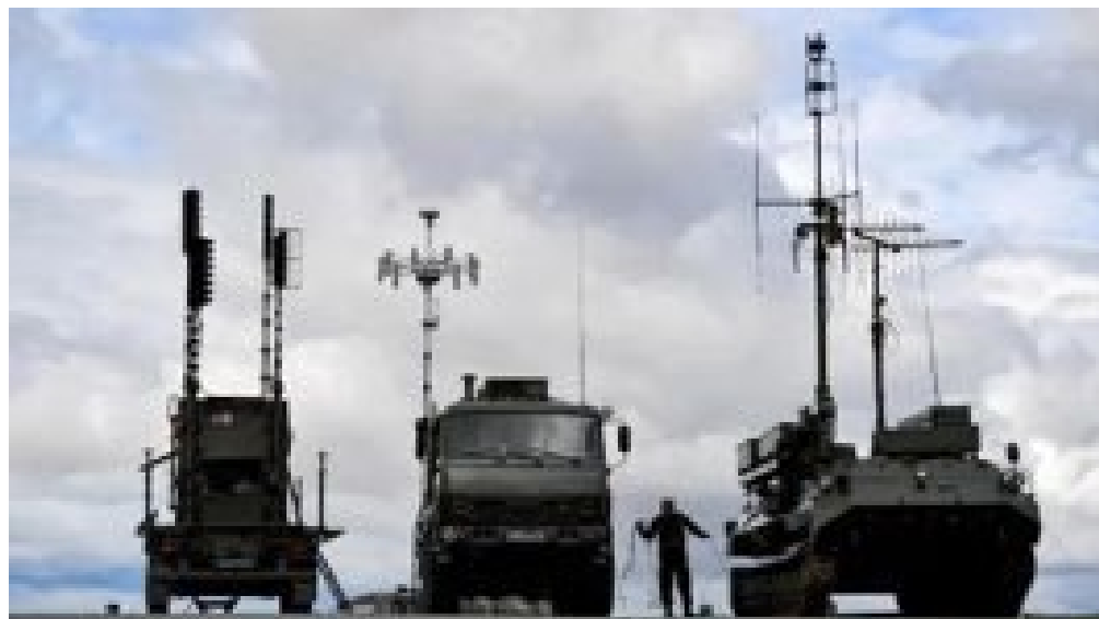
Pole-21 jamming system