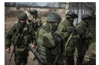
Russian Special Forces without identification markings in Crimea 2014.