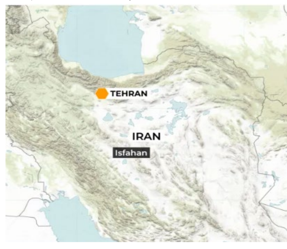
April 19: <u>Has Israel attacked Iran's Isfahan province? What we know so far</u>

Iranian State media reports that three small unknown flying objects were intercepted and destroyed over Isfahan. There were no reports of casualties. Isfahan is host to several important sites, including munitions plants, nuclear facilities military research and development, as well as military bases.