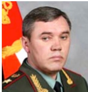
Gen-Army Valeriy Gerasimov

The Russian Ministry of Defense is subordinate to President Putin as Supreme Commander in Chief and is charged with implementing presidential policy within the military, overseeing all readiness, manpower, and procurement issues. The defense minister has the legal authority to oversee and direct operations of the General Staff.