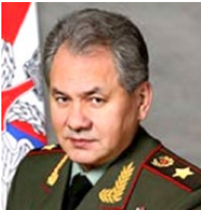
Defense Minister Sergey Shoygu

The Russian president governs foreign policy, signs international treaties, forms and heads the Security Council, and approves military doctrine. The Russian president serves as the Supreme Commander in Chief of the Russian military, and in times of emergency he may introduce martial law