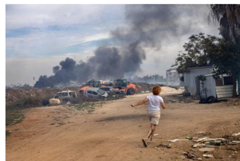
A woman running to a shelter after a rocket siren sounded in Ashkelon, Israel.

The Israeli military conducted an "intensive aerial strike" against Hamas military targets near the barrier.