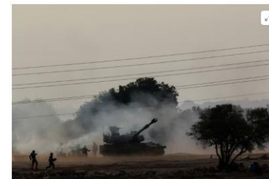
An Israeli tank is positioned near Israel's border with Lebanon, northern Israel, October 9, 2023.

The Israel Defense Forces said that not all of the breaches in the border fence had been fully closed, and more militants could still be crossing into Israeli territory from Gaza.