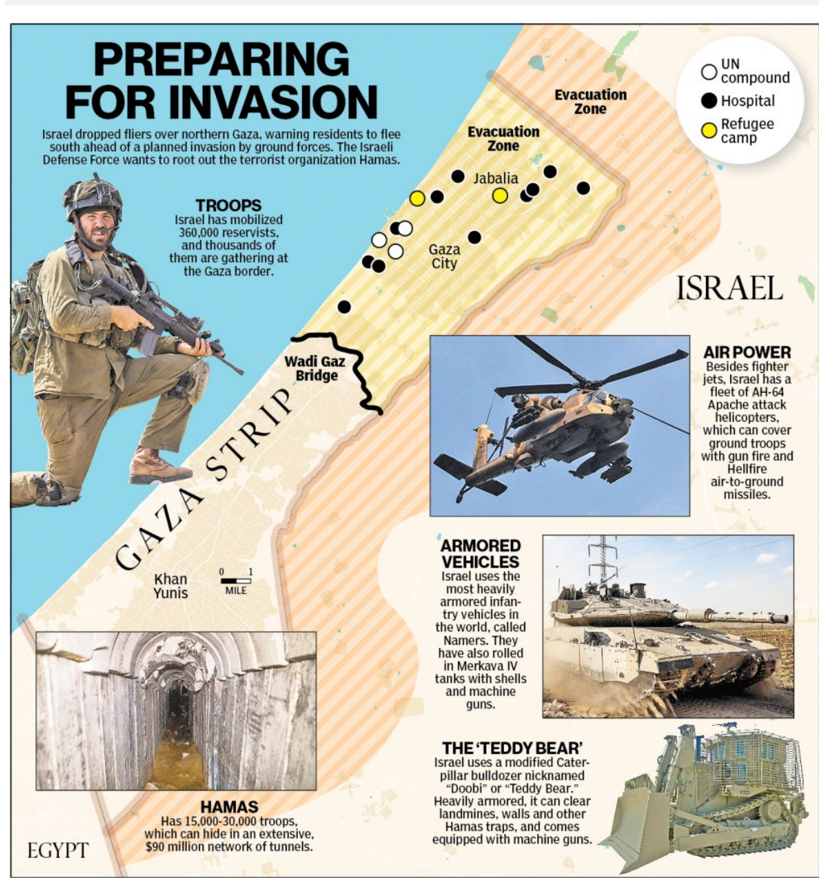
The IDF said troops have already carried out "localized raids" in Gaza to hunt terrorists and to attempt to find some of the approximately 150 Israeli hostages captured by Hamas.

(U) This infographic provides information on the potential Israeli invasion of Gaza. Israel has amassed a significant arsenal at the edge of Gaza as its war with terror group Hamas escalates. Israeli forces include 35 battalions containing 300,000 troops who will be supported by 300 tanks, scores of armored personnel carriers [APCs] and 100 fortified Bulldozers.