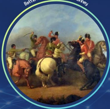
Battle of Cowpens by William Ranney

The Cyber Research Center's mission is to support the training and educational goals of our patrons through high-quality academic resources and research guidance.